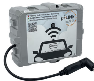
Pi-Link Vehicle to Cloud Connectivity