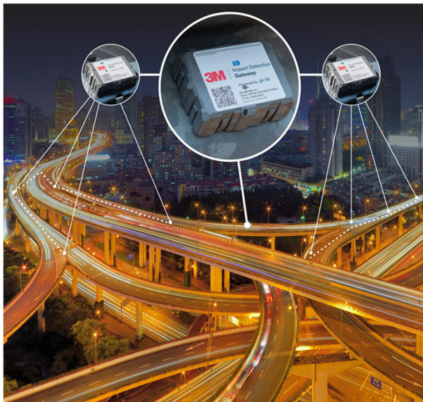
Impact Detection System 3M Partnership