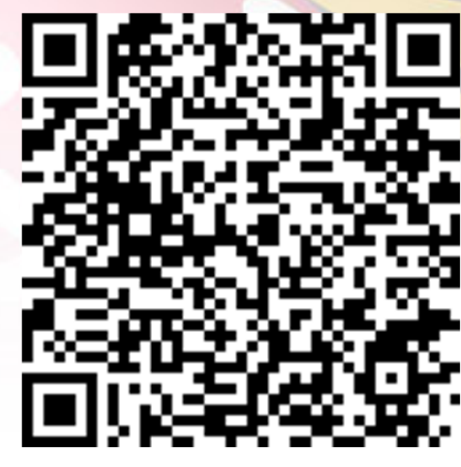
QR code to registration

https://www.eventbrite.com/ e/maryland-foundationalvehicle-to-everything-v2xtraining-tickets-922982414247